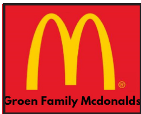
example of scorer's table