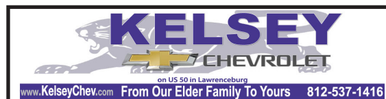
example of scrolling ad for pit and fieldhouse